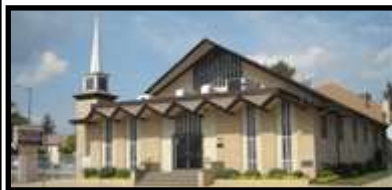
Our current home, 8200 Tireman Ave